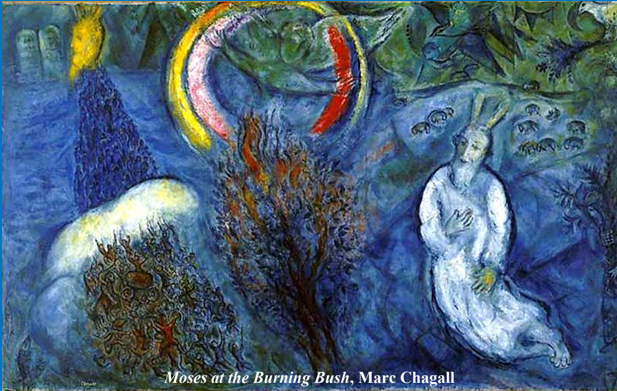
Moses at the Burning Bush, Marc Chagall