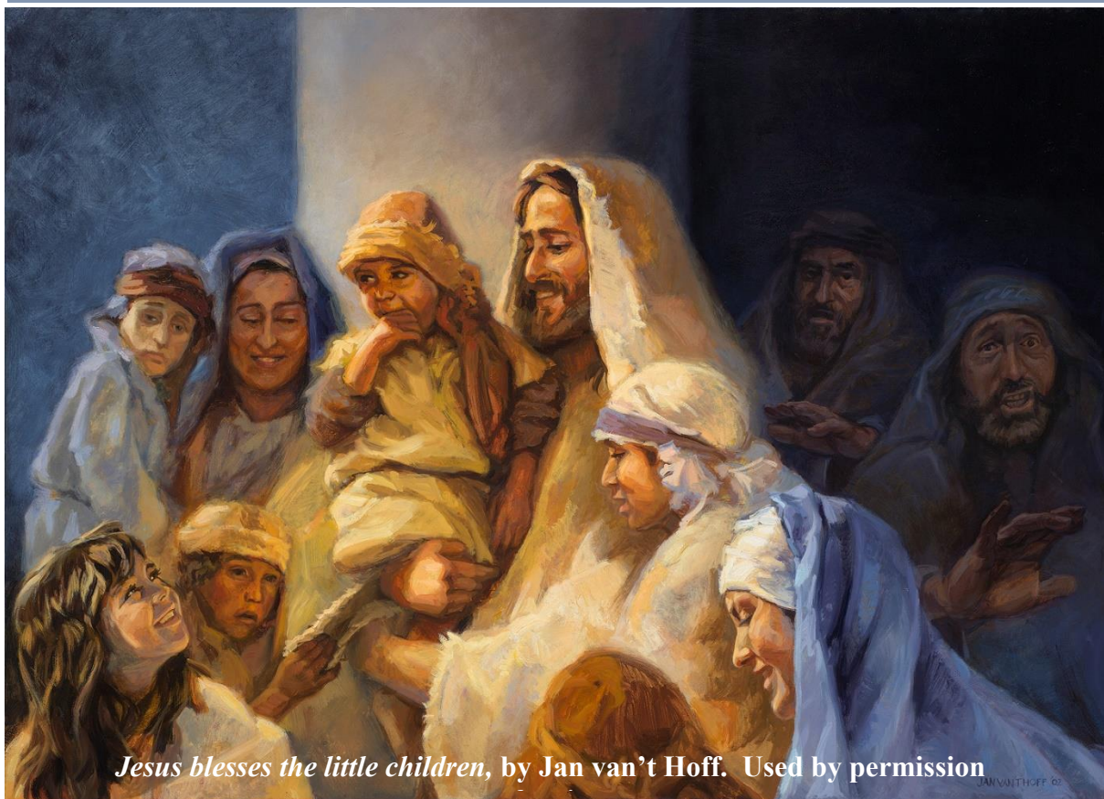
Jesus blesses the little children, by Jan van't Hoff. Used by permission